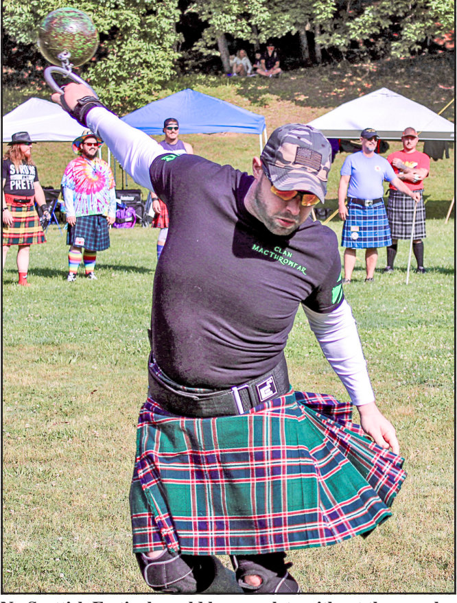
No Scottish Festival would be complete without the popular Highland Games, complete with kilt-clad contestants competing in traditional feats of strength.