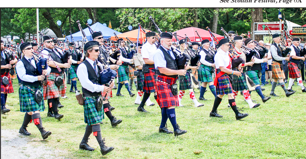
Many people's favorite part of the Scottish Festival is the annual Massed Band performance in the opening ceremony featuring all those sweet, sweet pipes and drums.